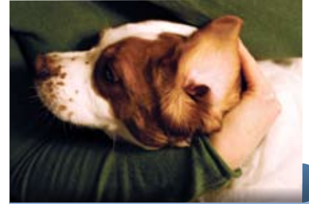
Use one hand to hold the ear flap back so that you can treat the ear with the other.