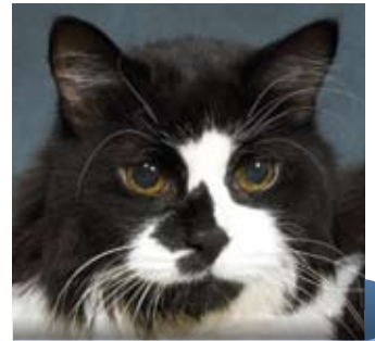
Healthy senior cats should see the veterinarian every 6 months.

Just as with people, it’s important for feline patients to see their doctors more frequently as they age. During a senior wellness exam, your veterinarian will screen your pet for a variety of age-related health concerns. A thorough senior wellness exam is designed to: