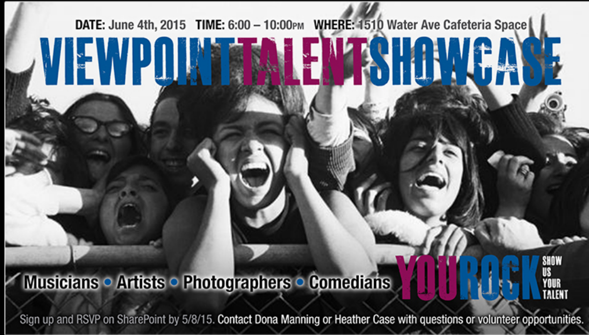
Design Modification 7A