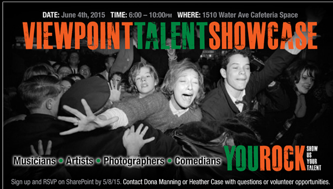
Design Modification 7C