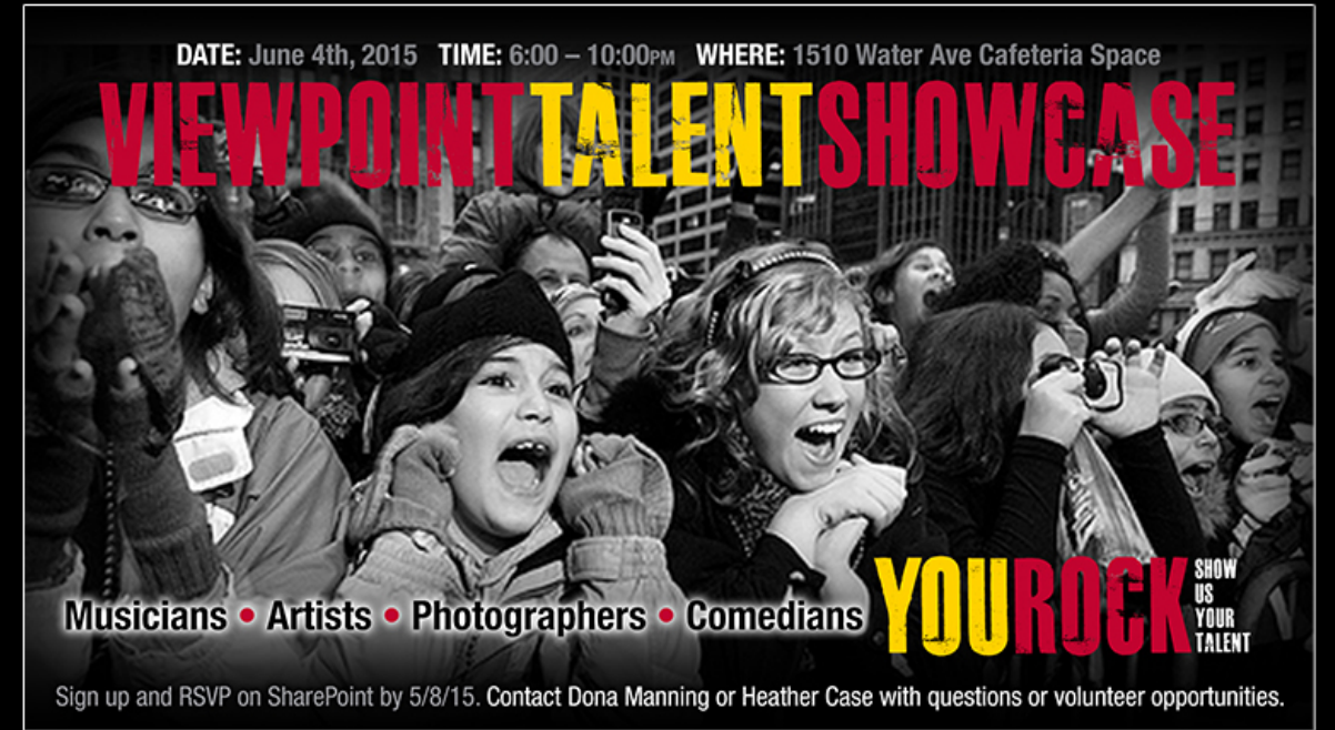
Design Modification 7B